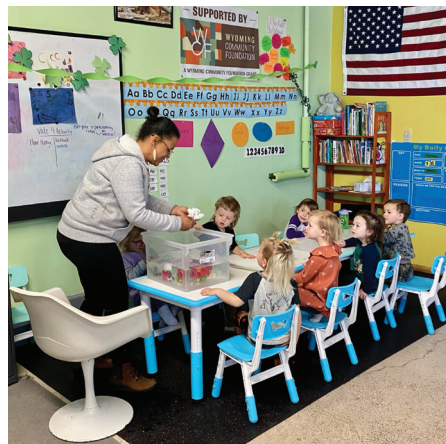
Toddlers are taught some of the basics like shapes and colors in MRD’s program and are able to enter Kindergarten more prepared.

Funding and space were two problems the MRD was faced with when