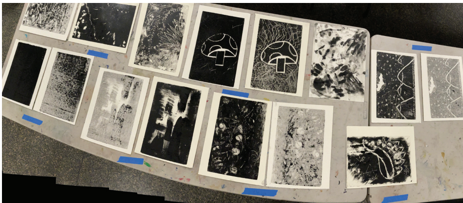
Classes offered to the community include printmaking, painting, and drawing for different levels of experience from beginner to advanced.