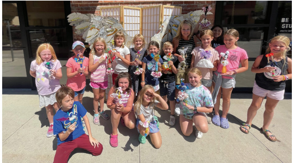
SAGE creates opportunities for youth to tap into their artistic journey through camps and classes.