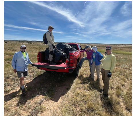
Volunteers work together to clean up trails at Pilot Hill.

Outside of the work to clean up or build new public spaces, what takes the most time is building local partnerships. “We don’t need more tools, we need people’s time,” says Ashley. “Thanks to the general operating grant from WYCF, we were able to say yes to many of our partners and give volunteers an opportunity to give back.