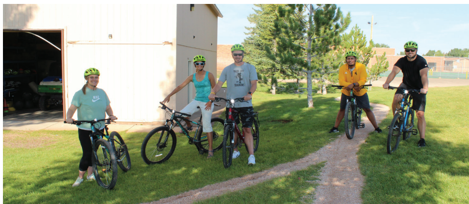
Staff at Laramie Middle School get ready to test out the trails for students during the upcoming school year.