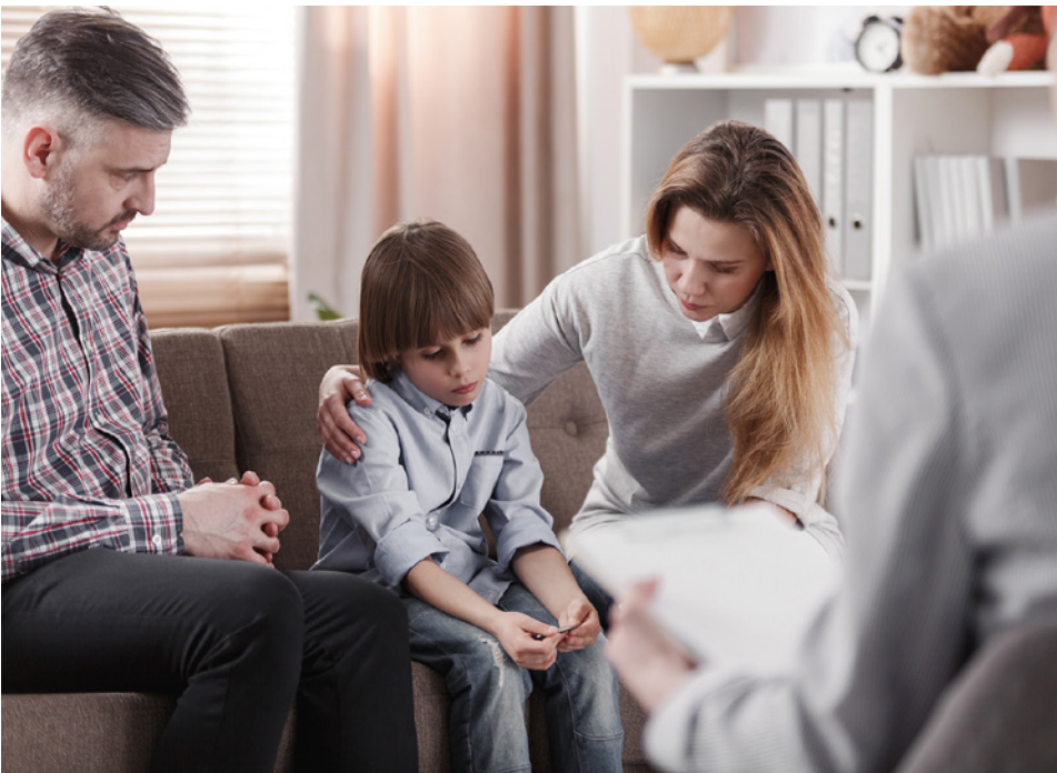
Family Tree Program helps mitigate divorces for families, free of cost in order to create the least amount of stress possible for children experiencing divorce.